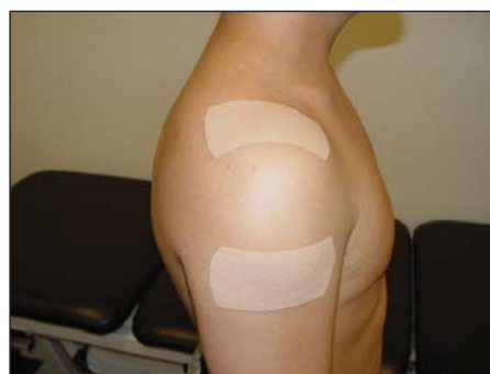
FIGURE 3. Sham Kinesio Tape application.