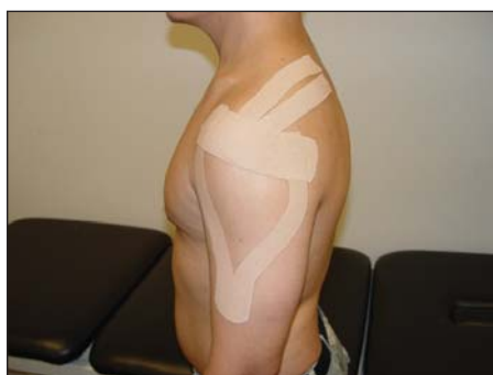
FIGURE 2. Therapeutic Kinesio Tape application.